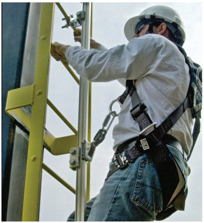
Single strap/clip in conjunction with continuous vertical safety line/rail

The alarm was raised, and first aid was delivered, but the victim had no pulse and was not breathing. CPR was administered for some time, but with no response, and was eventually declared deceased. The victim's body was removed from hold 6 and, when examined, both legs appeared broken just above the ankles. Bones could be observed