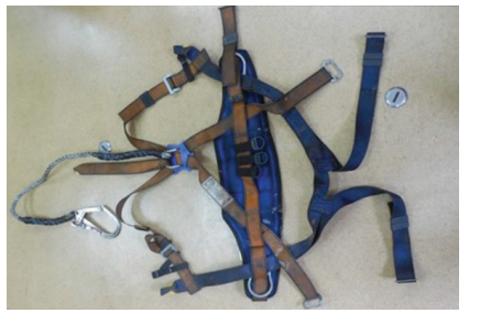
Safety harness used by victim