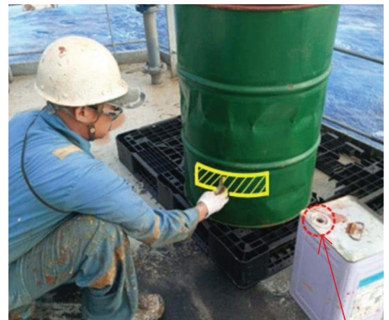
Reconstruction: note yellow rectangle showing access hole and open can of paint thinner

The burning of waste on an exposed deck was not approved by the Company's SMS. Despite this, the Chief Mate instructed the crew to carry out the task, revealing a gap in adherence to established procedures. The crew did not question nor challenge this instruction despite knowing that the company SMS forbids burning on the exposed deck.